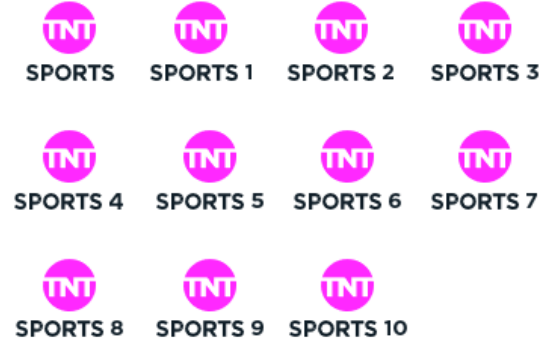
TNT SPORT LOGO & CHANNEL S 1-10 STACKED ON LIGHT BACKGR OUNDS